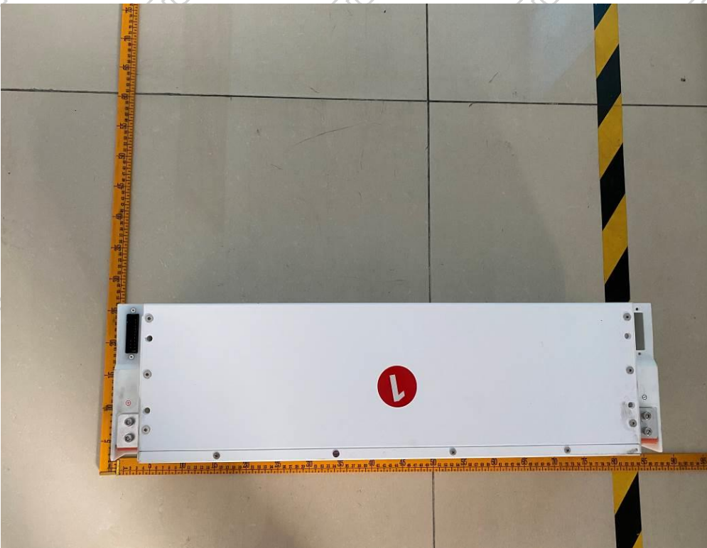
Figure 2 Overall view II of battery (电池图II)